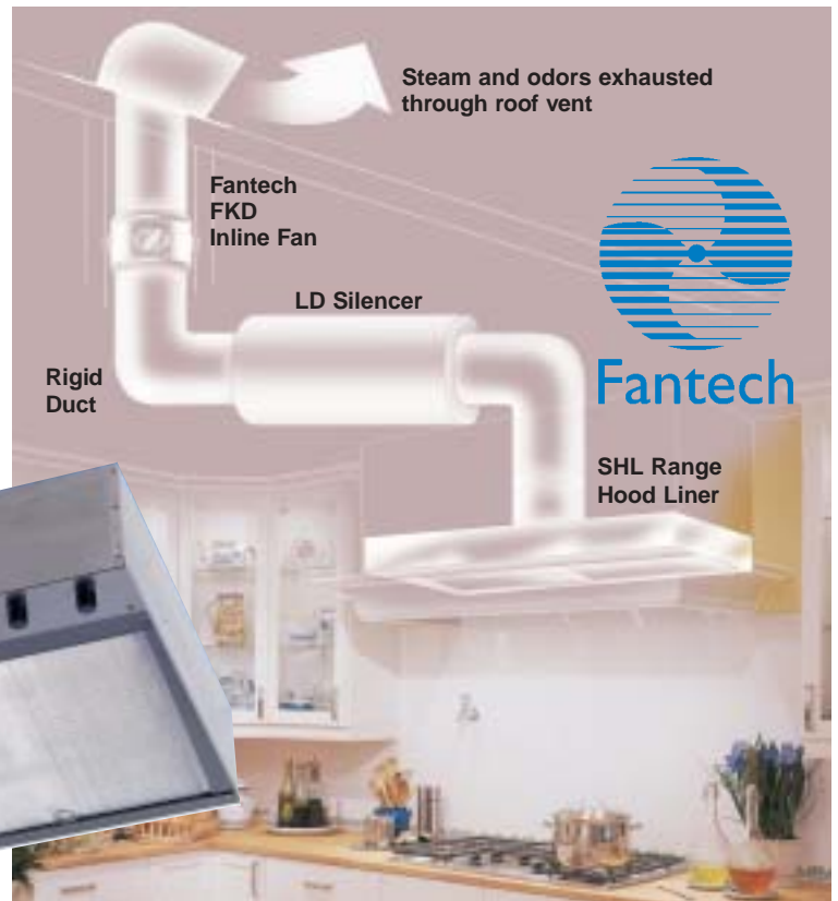
Typical Range Hood Installation using Fantech's SHL Hood Liner, LD Silencer and FKD Inline Fan. Hood liner can also be used with Exterior Mounted Fans. See fan selection chart below.

†Duct connections are 1/8" smaller than duct size.